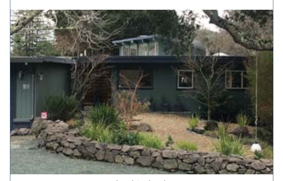
4 bed/4 bath Approx. 3,300 sq ft

Fabulous True Mid-Century Modern Home 40 Acacia Drive, Orinda